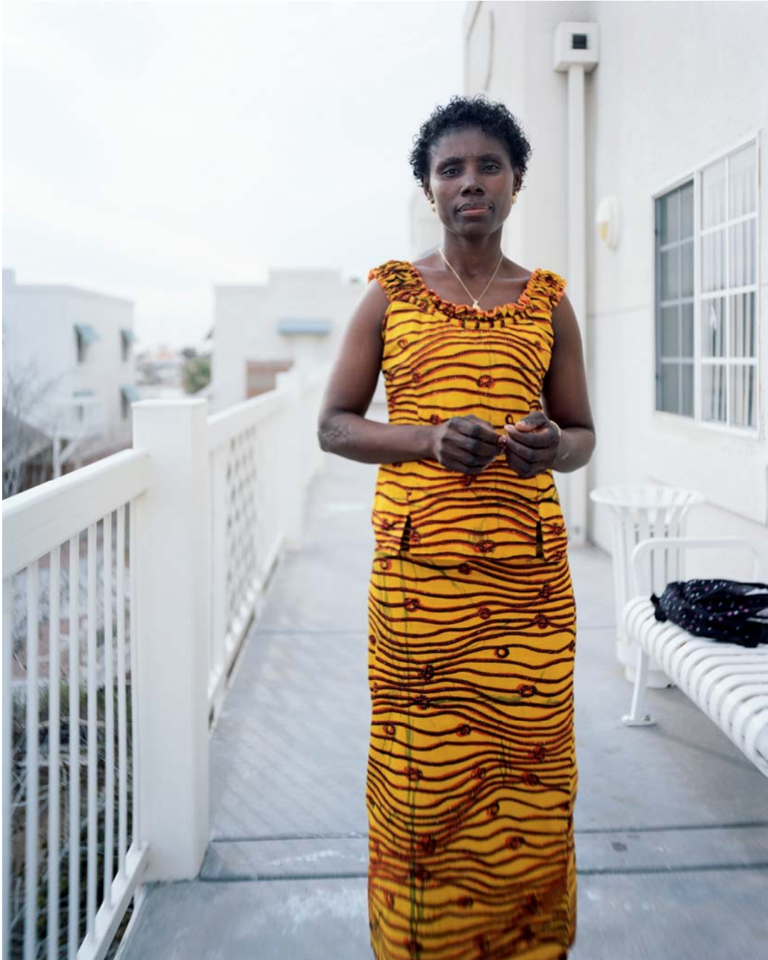
FUSE: Portraits of Refugee Households in Metropolitan Phoenix April 3 rd to October 3 rd 2008 Education Package